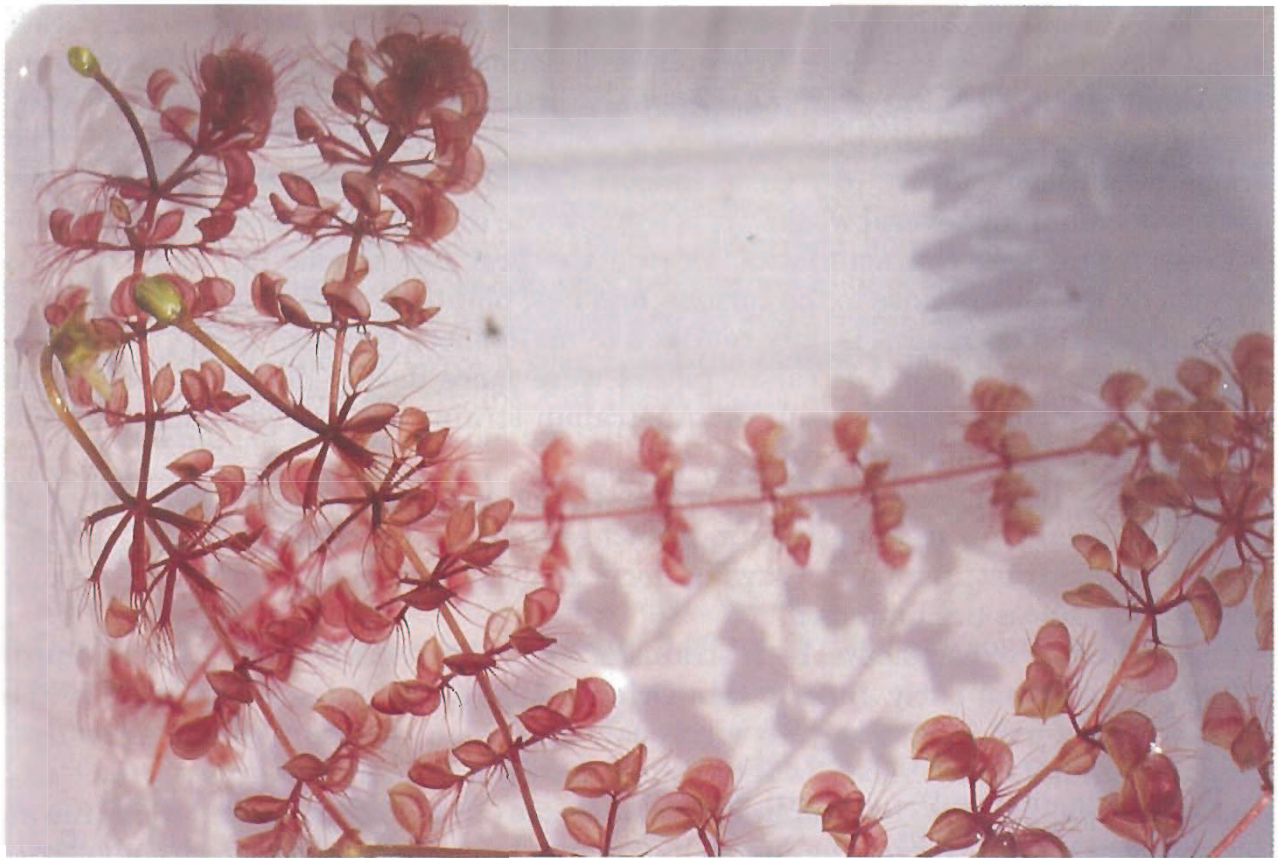
Figure 1: Flowering Aldrovanda vesiculosa from north Australia grown in indoor aquarium, September 1998.