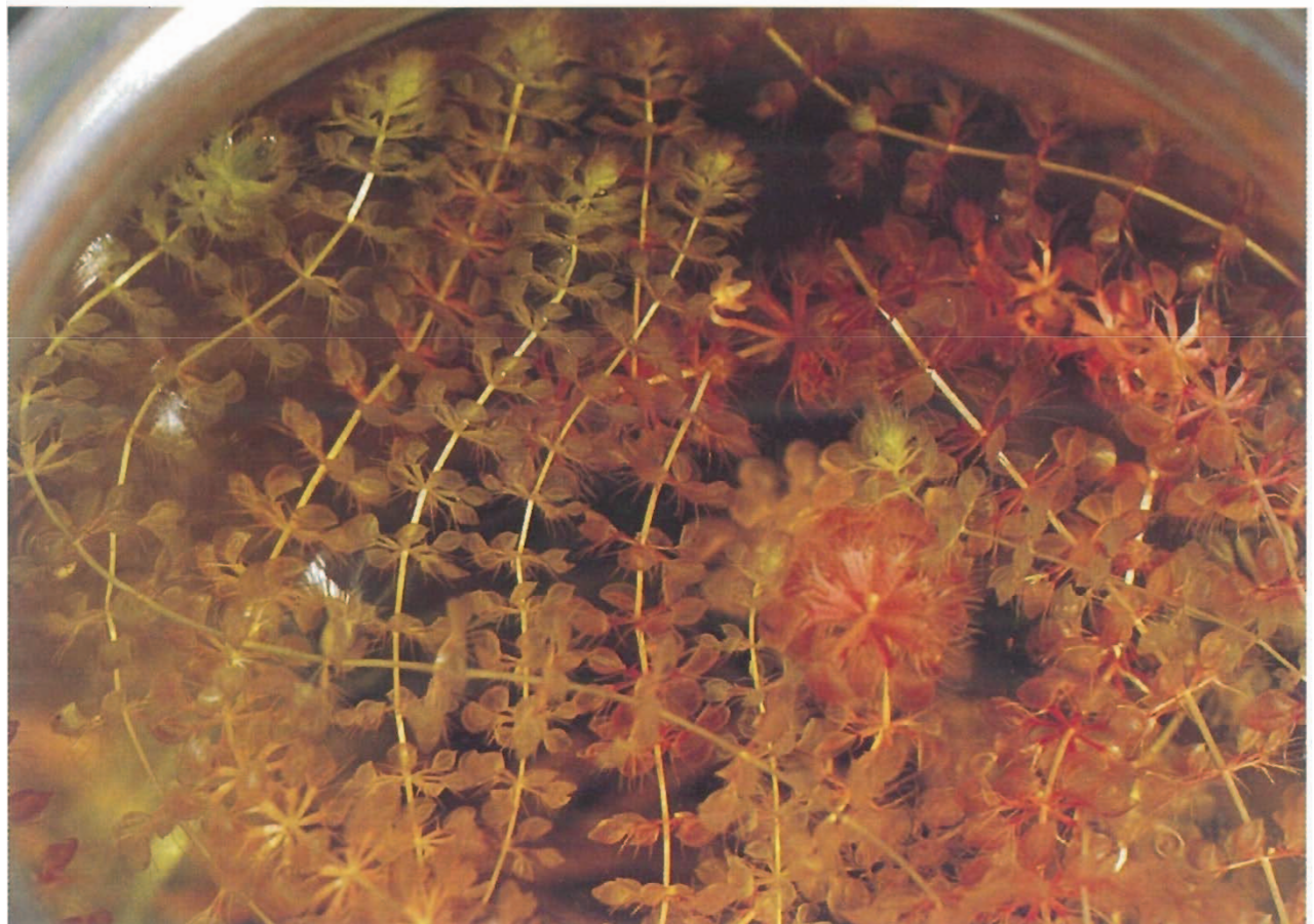
Figure 2: Aldrovanda vesiculosa from southeast Australia in a 3-liter aquarium, October 1998.